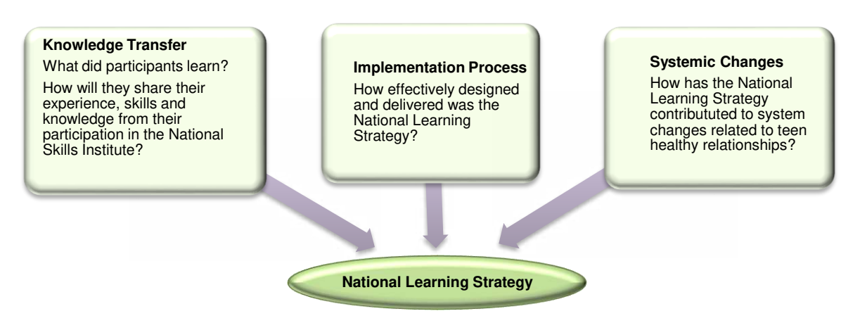
Table 5: Three main areas of the Evaluation Framework of the National Learning Strategy. (See the Evaluation Framework)

There were three main areas explored within the Evaluation Framework for the National Learning Strategy : Knowledge Transfer, Implementation Process and Systemic Changes.